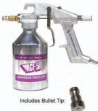
Includes Bullet Tip: